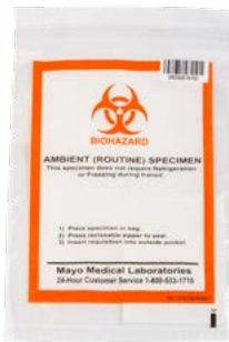
T027 Ambient specimen bags