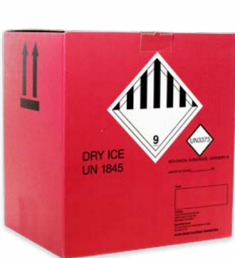
T328 Frozen shipping box