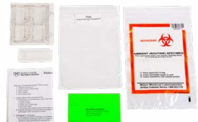
T787 Pathology packaging kit