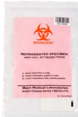
T229 Refrigerate bag (Pink)