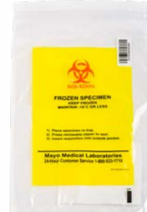
T121 Frozen specimen bags