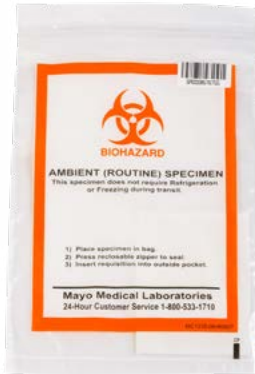
T027 Ambient bag (Orange/White)

Pack specimens in our color-coded biohazard bags