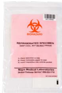
T229 Refrigerate specimen bags