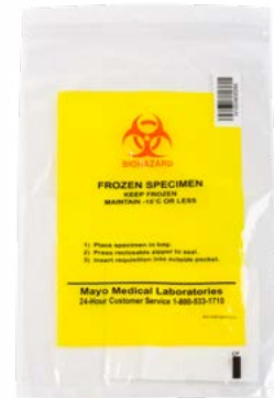
T121 Frozen bag (Yellow)