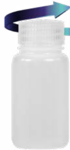
T068 Urine container