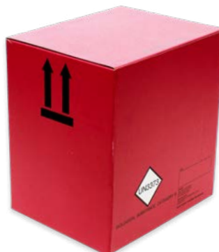
T362 Refrigerate/ambient shipping box